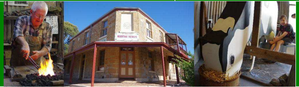
Volume 16 Issue 2