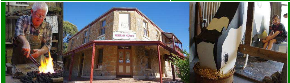
Volume 13 Issue 4